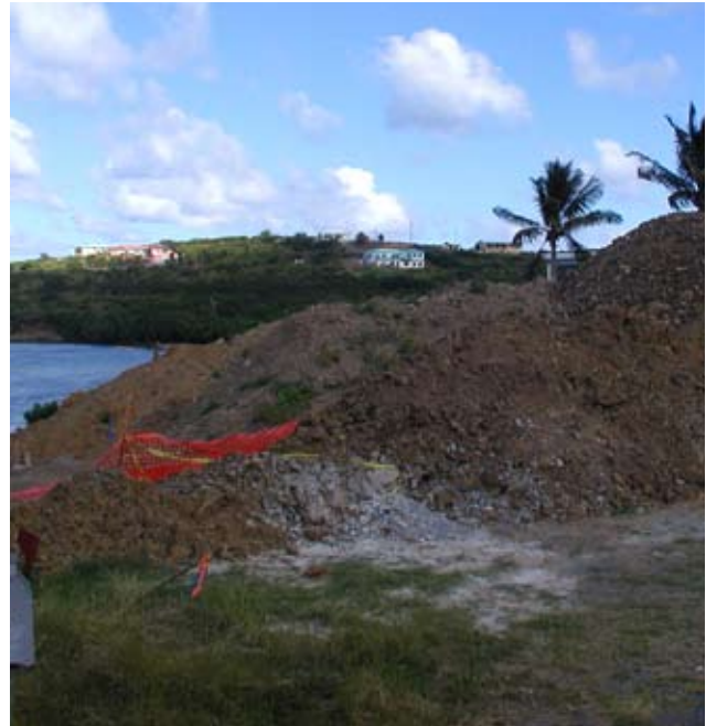
Coastal development often results in sediment runoff into coral ecosystems; sediment can carry a range of pollutants and can itself smother coral.

necessary. Understand water quality status and trends resulting from land-based sources of pollution so that best practices can be formulated and applied in priority areas.