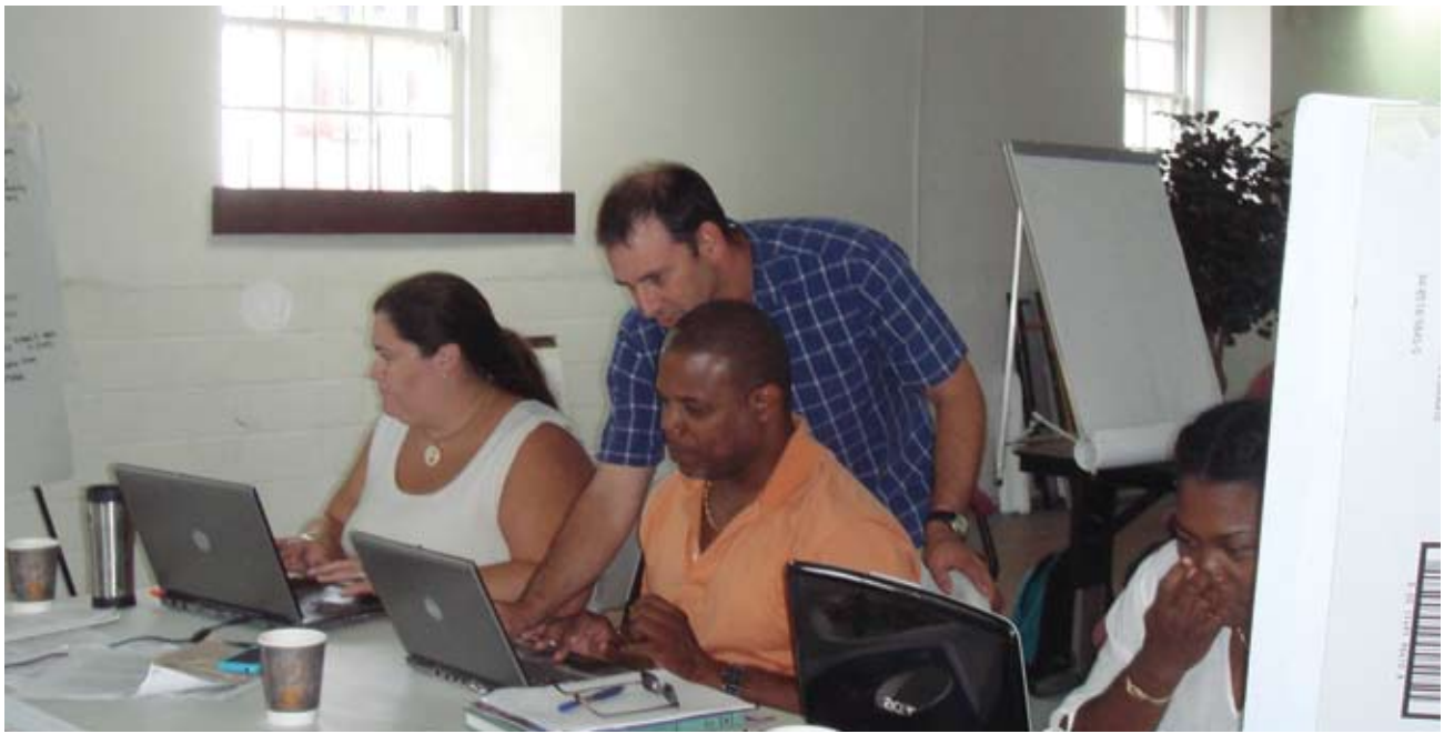
During the priority setting workshop, core managers met in small groups to identify goals and specific actions to implement the priority goals.

objectives to address each of these need areas. Participants were asked to develop goals and objectives for the coral reefs for all of the USVI, rather than for each workshop participant's local managed area.