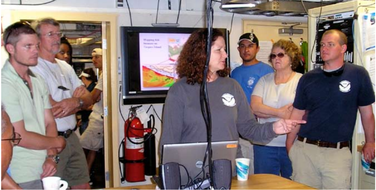
Education activities, such as VIP tours during research cruises, help increase buy-in and support for coral conservation by decision-makers.