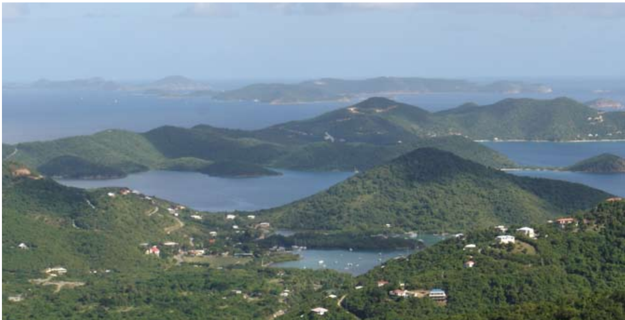
The Coral Bay watershed on St. John, USVI.