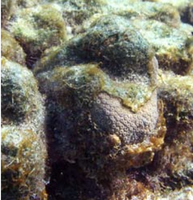
Turf algae overgrows coral off the coast of St. John. Increased nutrients from runoff upset the balance between coral and algae on a reef.