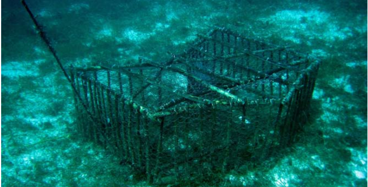
Derelict fish traps and nets contribute to negative impacts from fishing in the jurisdiction.