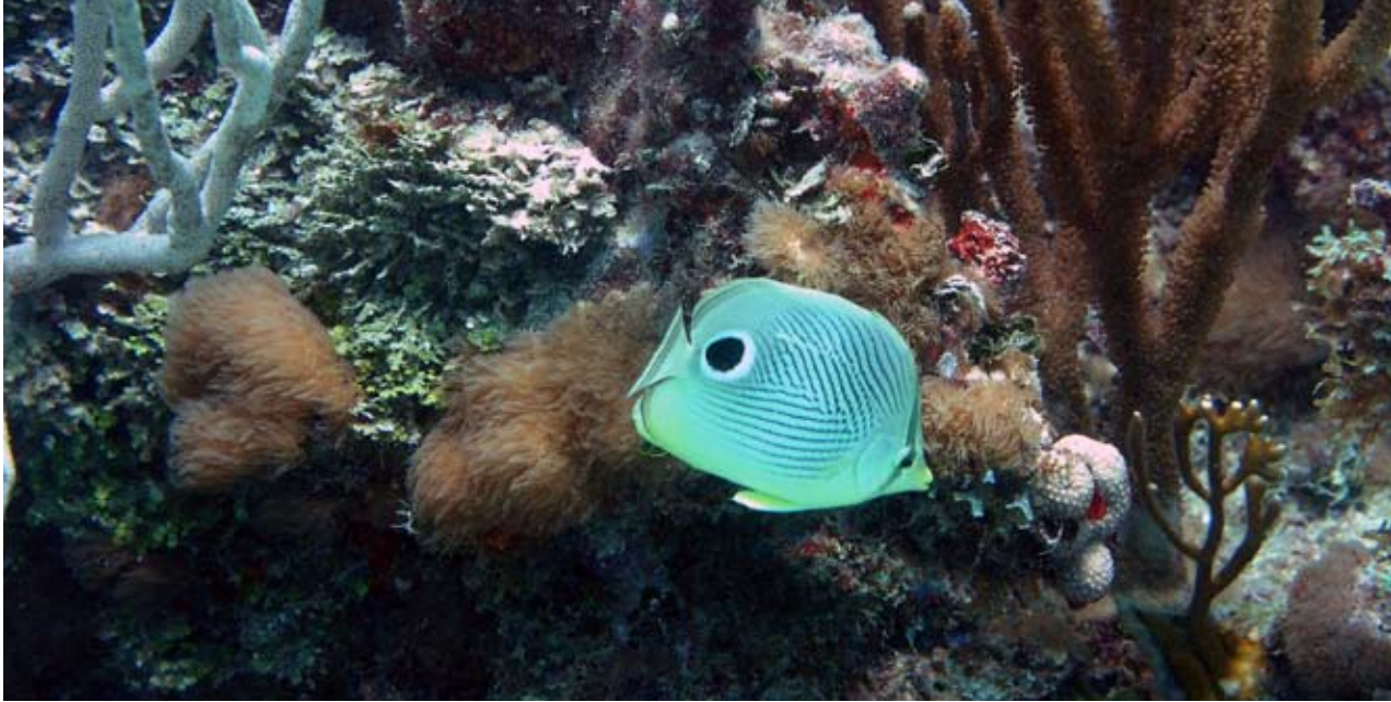
A Foureye Butterflyfish forages on a reef off the coast of St. John, USVI.