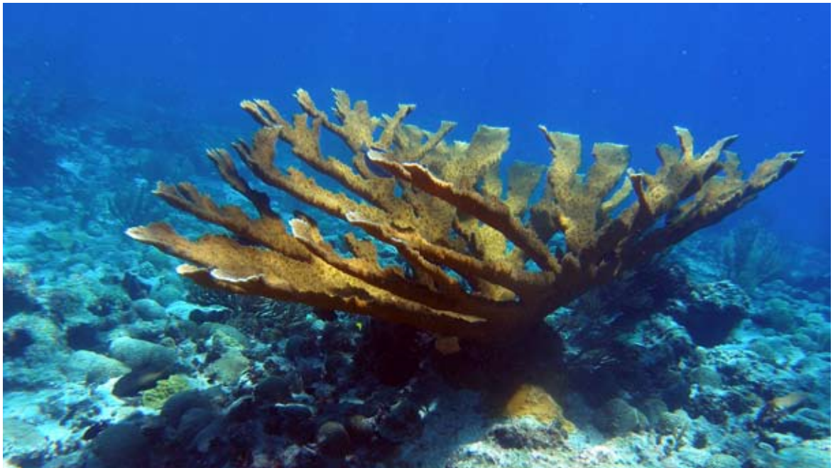
Elkhorn coral, listed as 'Threatened' under the Endangered Species Act in 2006, can be found in USVI's waters.

This table shows how USVI's Priority Goals and Objectives correlate to NOAA CRCP's National Goals and Objectives for coral reef conservation. This table was developed after the USVI Coral Reef Management Priority Setting Process was complete to explicitly identify potential partnerships between the managers in USVI and NOAA CRCP. Addressing both local jurisdictional priorities and national goals and objectives will increase efficiency and leveraging of the resources available for coral reef conservation. NOAA CRCP will use this table to inform future investments in coral reef conservation in USVI.