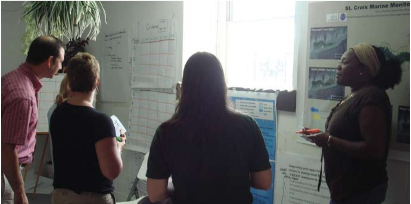
During the priority setting workshop, managers worked to develop and apply criteria for the identification of priority coral reef sites.

The Priority Goals and Objectives are highlighted in magenta/bold and magenta/italic font, respectively. The attendees selected the priority actions during the workshop and through an online vote that occurred after the workshop.