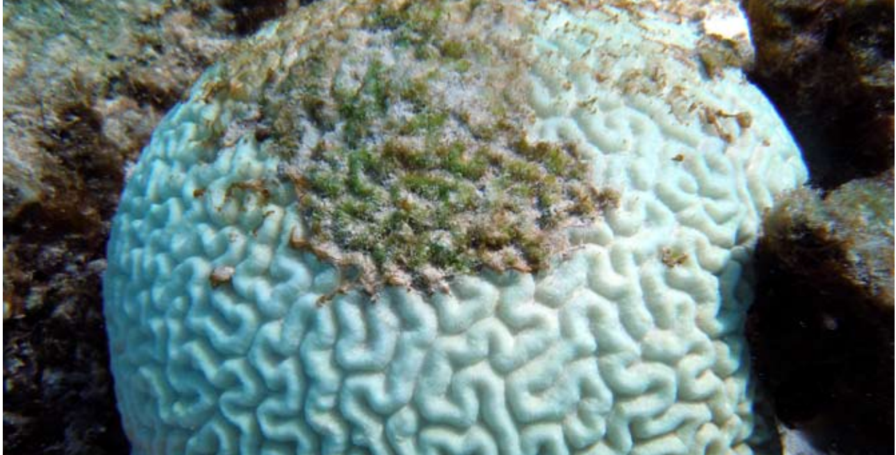
This Symmetrical Brain Coral head was unable to recover from a coral bleaching event and subsequently died.

closed to the public when bleaching has been severe.)